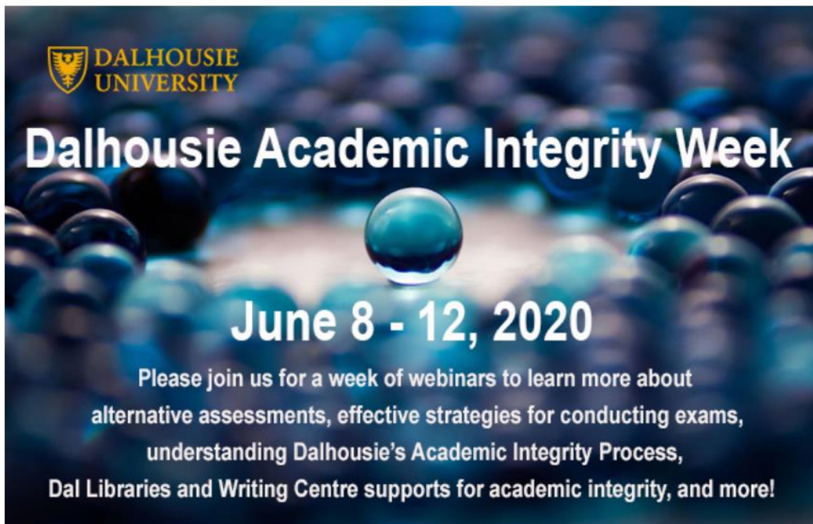
Figure 4. Description of Dalhousie University Academic Integrity Week Programming

As we make the move to online teaching, we need to ensure the continued academic integrity of our students' learning. What approaches can we take, and what considerations do we need to make, to encourage and support students' honest engagement in the assessment process?