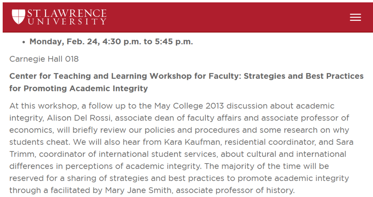
Figure 2. Description of St. Lawrence University Academic Integrity Week Programming

Screenshot taken May 3, 2020 (Integrity Week, 2014).